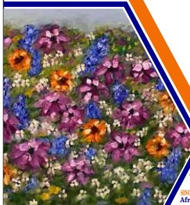
SINGING FLOWERS Afraha Jassim